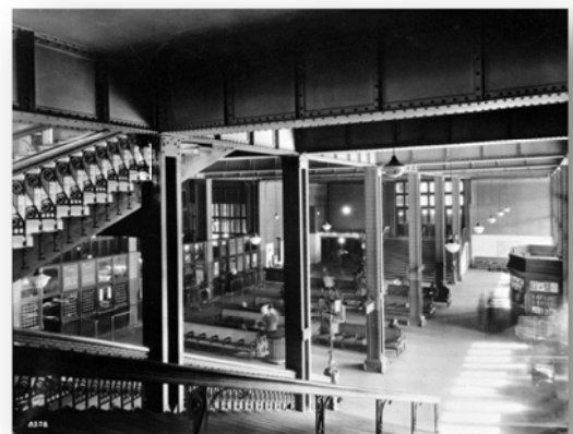
B & O's 24th and Chestnut Street Station's Lower Level, Waiting Room Looking East from Stairs, ca. 1920. Photograph. Library of Congress, Prints & Photographs Divisions, HABS PA, 51-PHILA, 405-15.