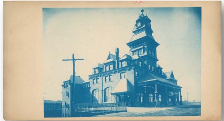
B & O Philadelphia Station at 24th and Chestnut Streets, 1891. Cyanotype. The Library Company of Philadelphia.