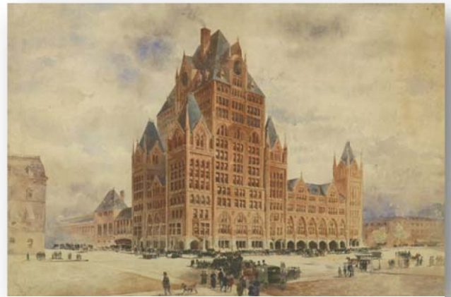
Furness, Evans and Co. Proposed Addition to Broad Street Station, 1892. Watercolor on paper. Philadelphia History Museum at the Atwater Kent on long-term loan to the Athenaeum of Philadelphia through the Pew Charitable Trusts Museum Loan Program.