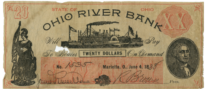
Ohio River Bank. Counterfeit note, 1838. Bequest of Helen Beitler.

Although the rogues' gallery of gray- and black-market operators presented in this exhibition were excoriated by prominent businessmen, reformers, and authorities of the time, they often had intimate ties to legitimate commerce and enjoyed the patronage of these very critics. Ultimately, illegal forms of commerce were integral to the success of the larger American economy and continue in varied forms today.