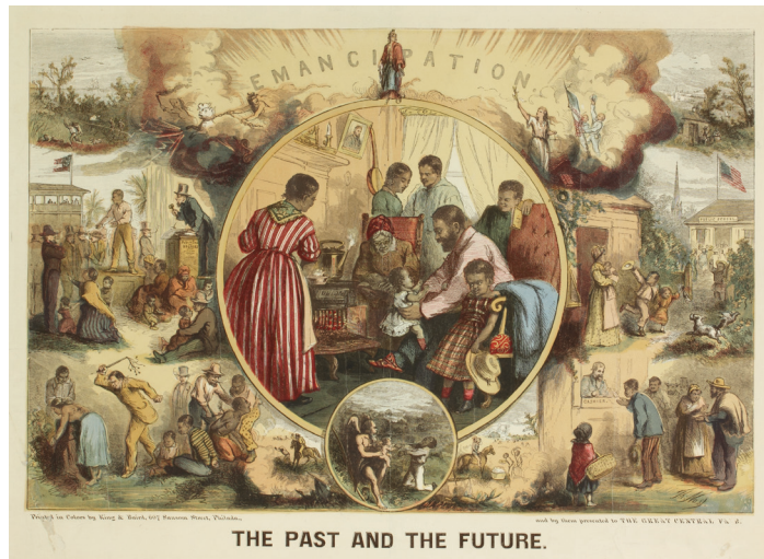
Thomas Nast, The Past and the Future (Philadelphia: King & Baird, [1864]). Color wood engraving.

When the Republican Party held its first nominating convention in Philadelphia in 1856 it was little more than an inconsequential minority, disliked and distrusted for its abolitionist taint. By the end of the war ten years later it was on its way to becoming the dominant political force in the city. The Emancipation Proclamation infuriated Democrats, some of whom urged a negotiated settlement with the South. But the Confederate invasion of central Pennsylvania and Union success at Gettysburg stiffened Union-