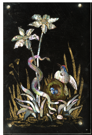
Papier-mâché, enameled, and inlaid with mother-of-pearl binding, ca. 1850-1855.