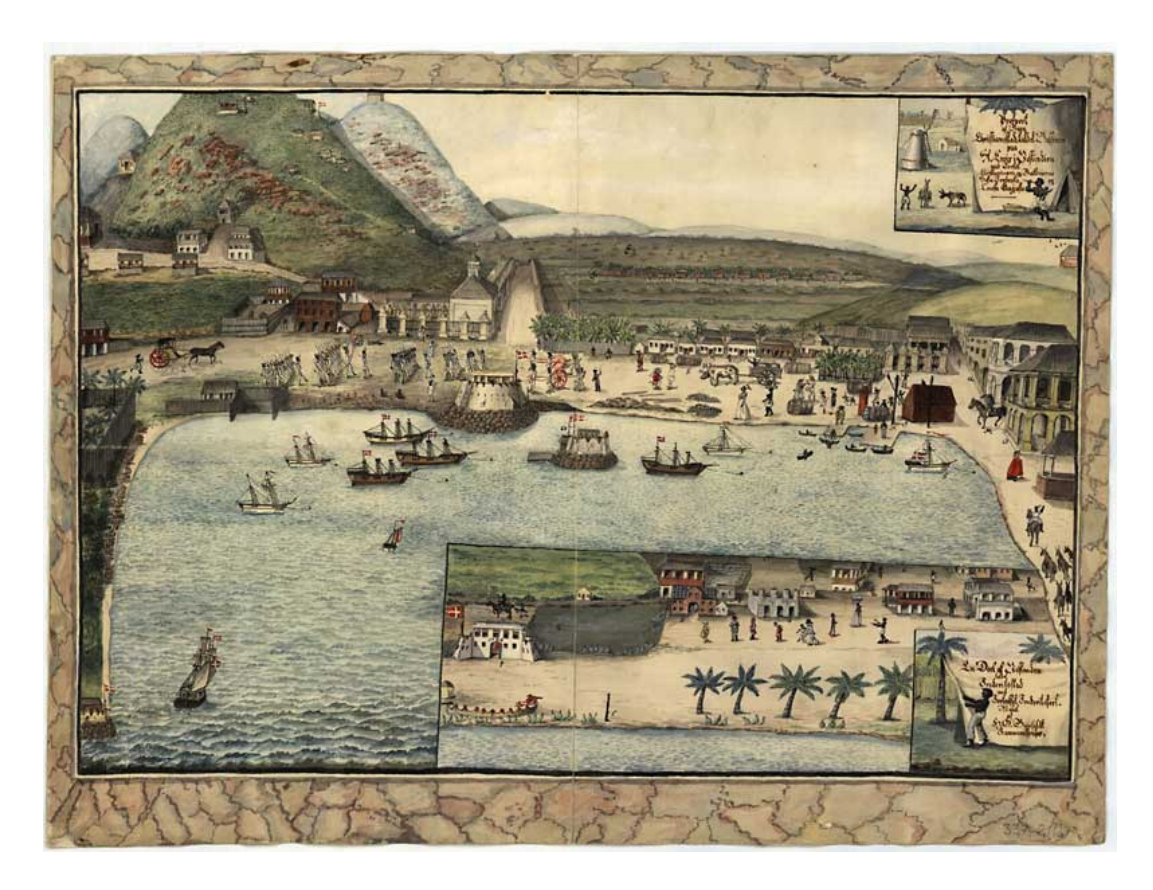
Illustration 4.1: H.G. Beenfeldt, "Port of Christiansted," watercolor, 1815.

The coffee they sent, though still lower than pre-revolutionary import levels, filled an important commercial gap and the colony's rising profits caught the eye of the Danish crown which briefly attempted to impose a royal monopoly on shipping at the end of 1781, but soon repealed the measure after vociferous protest—including a delegation to Copenhagen.<sup>24</sup>